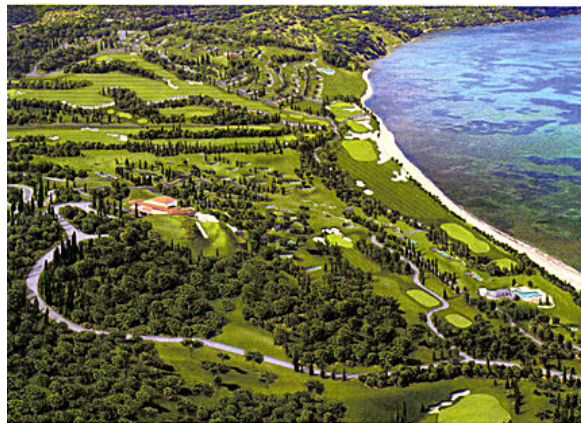
History meets luxury: Navarino Bay, now an exclusive eco-resort, was in 1827 the focus of the Greek War of Independence

Aegean Airways offers flights from London Heathrow to Athens, as well as daily flights from Athens to Kalamata. For more information, visit aegeanair.com