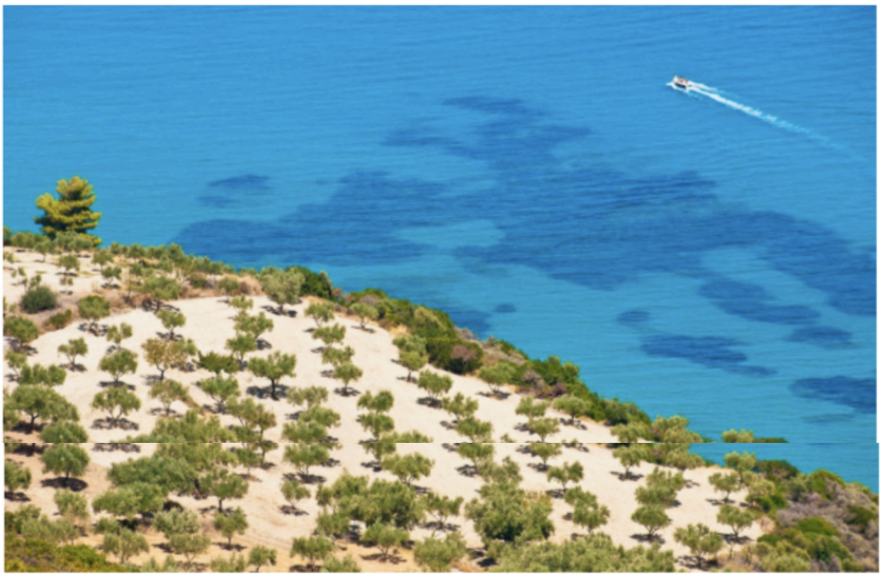
The unmistakable coastline of Mediterranean Greece

In the Eighties he bought up parcels of land in his native Messinia. Today those small pieces have grown to become a vast estate boasting two major hotels out of a planned five. The family-friendly Westin and more chilled Romanos sit in proximity to each other, flanked by two world-class golf courses and the whole estate borders the historic Navarino Bay.