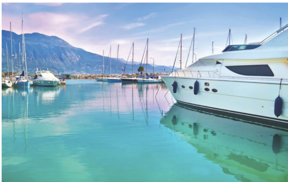
Kalamata on the Ionian Sea