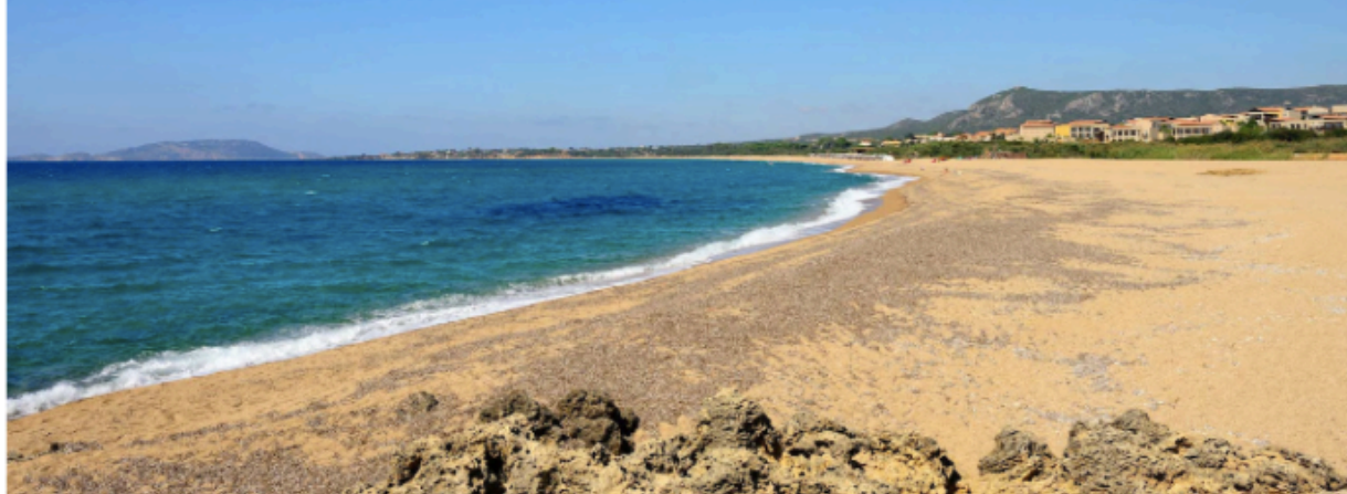
A beach at the Costa Navarino resort

The Pylos population of 2,000 includes some 750 Navarino employees, with young people being trained in skills from beauty therapy to tennis coaching and hospitality. No wonder the resort boasts such impeccable service; every employee seeming genuinely friendly. I'm not a natural resort lover but I was seduced.