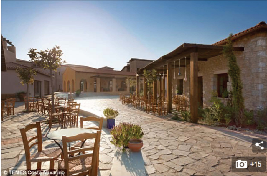
The hotels on the development have several restaurants and bars, along with a spa

'The quality is supreme and you would not find the finish anywhere else in Greece, if not in the Mediterranean.'