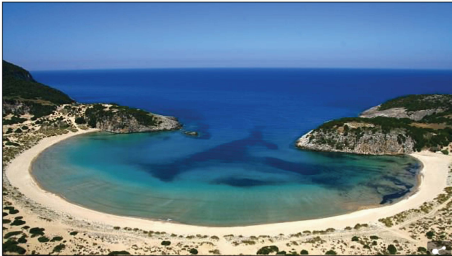
Actor Ralph Fiennes said nearby Voidokilia Beach was the place where he was happiest