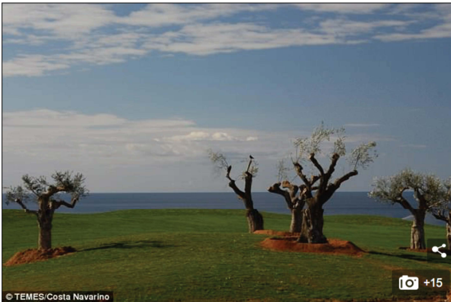
More than 6,000 olive trees have been successfully moved to make way for the new properties