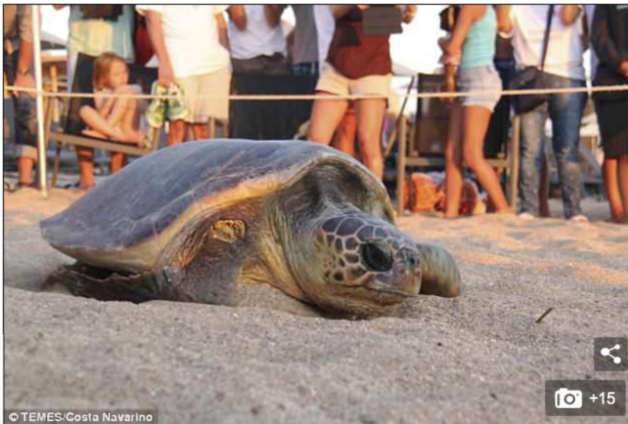
Costa Navarino is an eco-friendly development, taking care to protect the sea turtles that come to nest on the beach