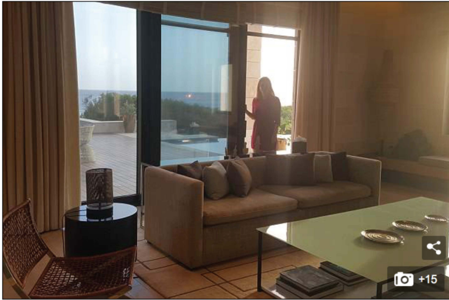
MailOnline Property's Myra Butterworth checks out the Costa Navarino development

Sea turtles can be disorientated by bright lights and so the resort has been built on descending levels as it approaches the beach to avoid harming them. The new houses will follow suite, with the majority being built on one level – something that provides the bonus of uninterrupted views.