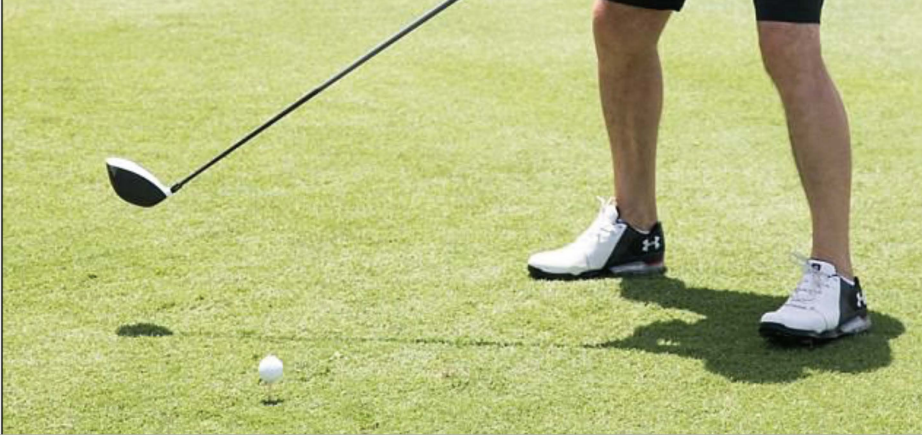
Singer Keith Duffy is pictured playing in the annual golf tournament in Costa Navarino