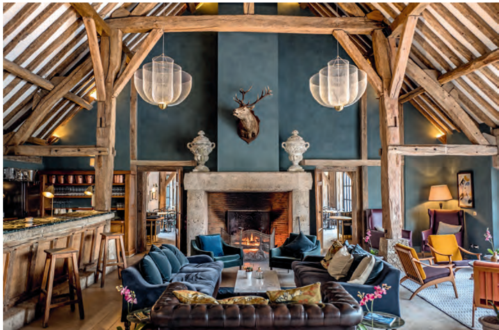
Lounge by the fireside with a drink at Les Bordes in France