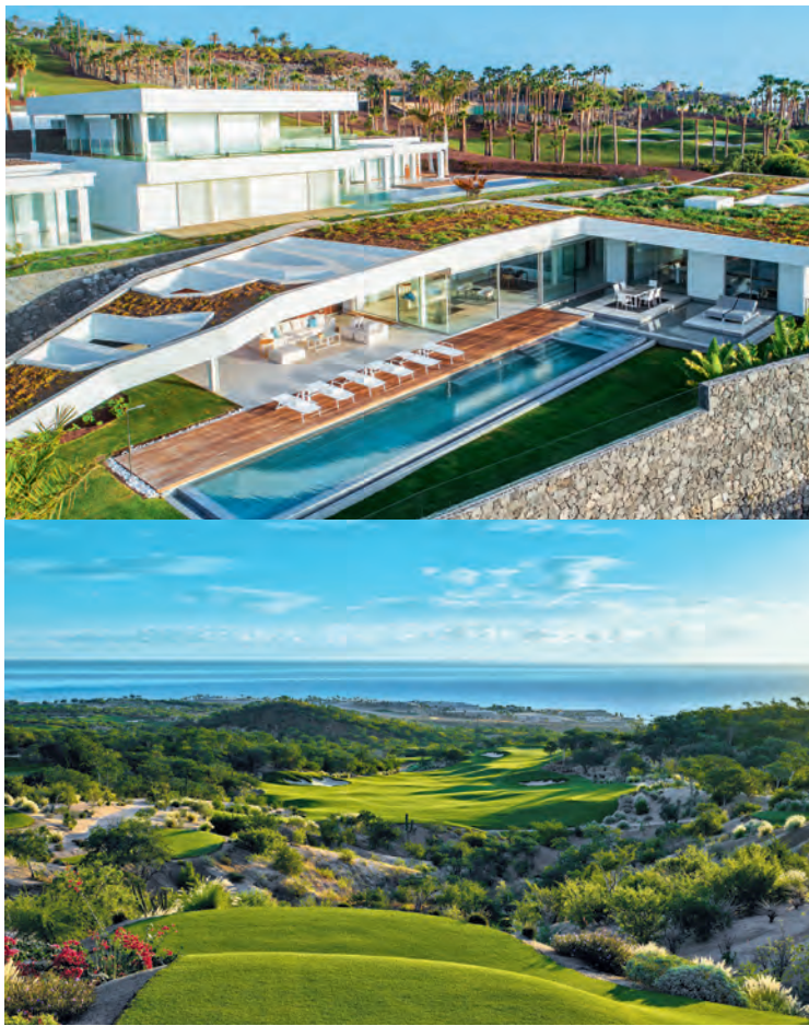
From top: a private paradise at the Abama Resort in Tenerife; the Tom Doak-designed course at Chileno Bay in Cabo San Lucas, Mexico, includes panoramic tee boxes; a well-appointed living room with a view at La Zagaleta in Spain