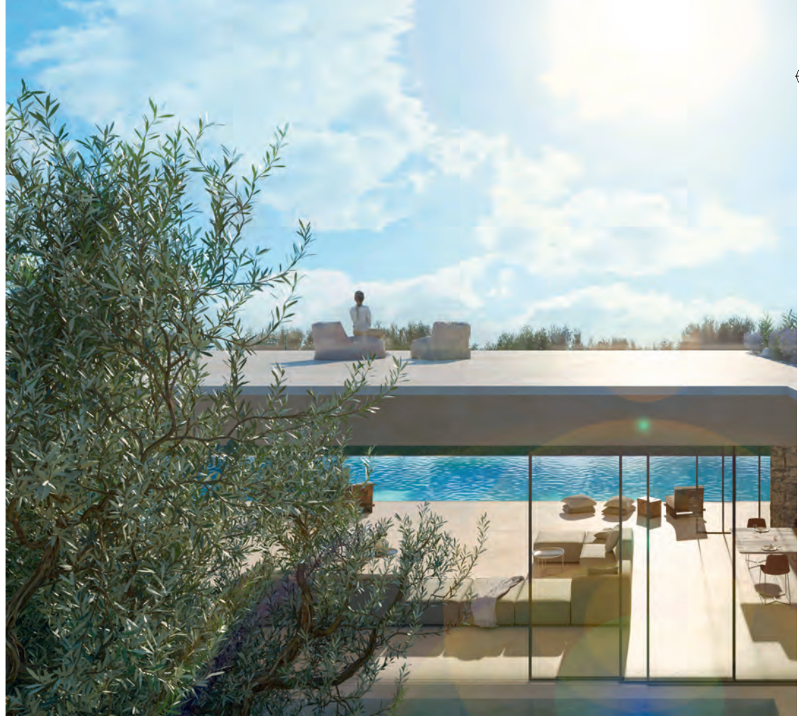
From top: a bird's-eye view of the Anahita community on Mauritius's east coast; a multi-level villa design at Kilada in Greece