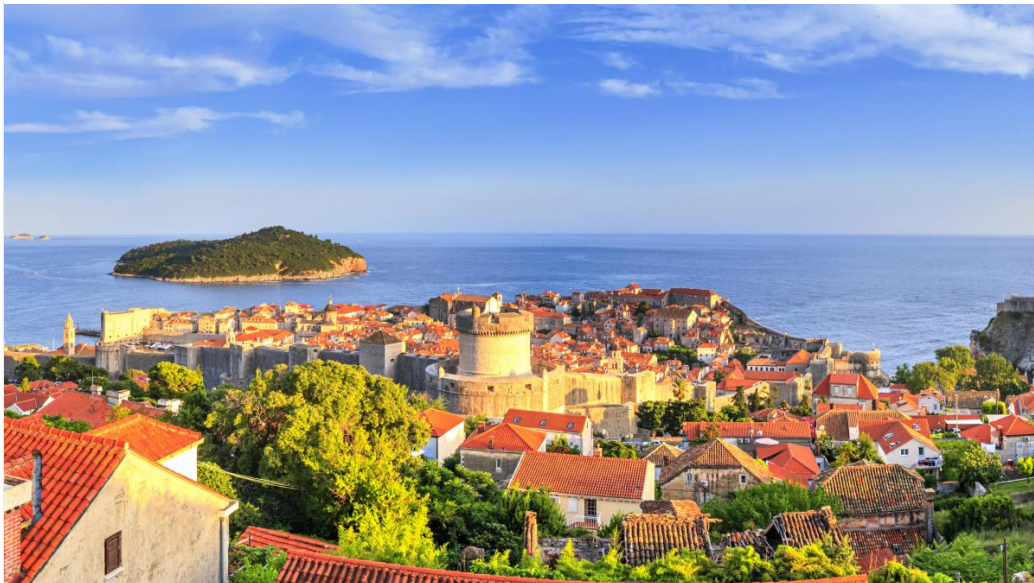
Dubrovnik, Croatia

If you can't stand the grey skies any longer, get an office on the beach. We speak to those who have taken the plunge